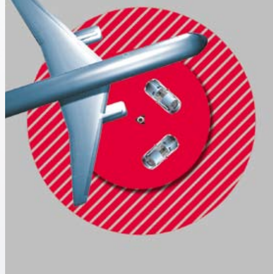
Leica AT901-MR gives you a measurement volume of up to 18 m (59 ft), Leica AT901-LR up to 30 m (98 ft)